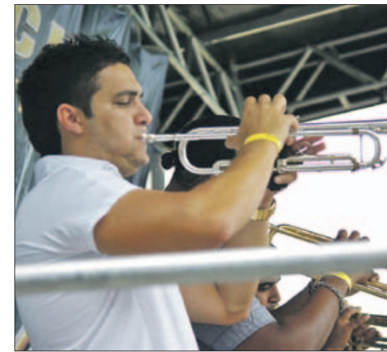
On stage at the Latin Square