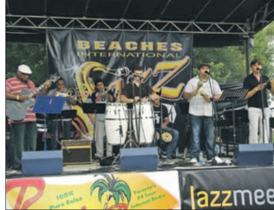
The Group La Calu Orquestra