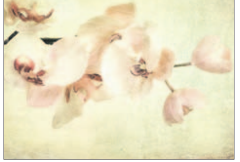
"Orchid Dream" by Toni Wallachy

Sotheby's International Realty Canada, Brokerage 497 Davenport Road, Toronto ON, M4V 1B7 This is not intended to solicit buyers or sellers under contract with a brokerage.