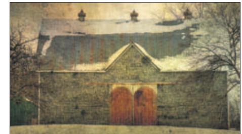
"Old Country Barn"