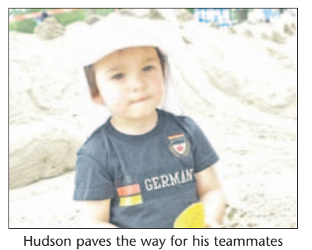
inside the castle