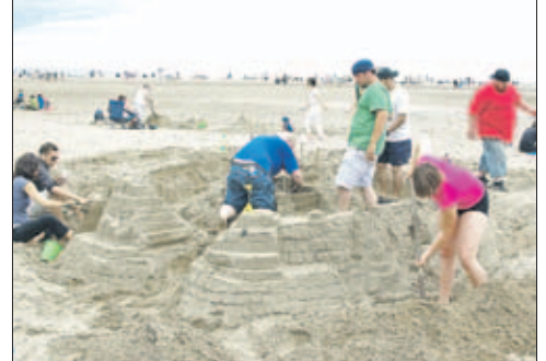
Teammates work together as they form the walls on their castle