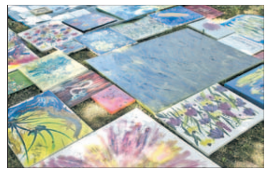
Artwork sprawled out across the park at Harrison Estate Park