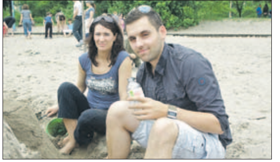
Participants dig around the edges of their fortress