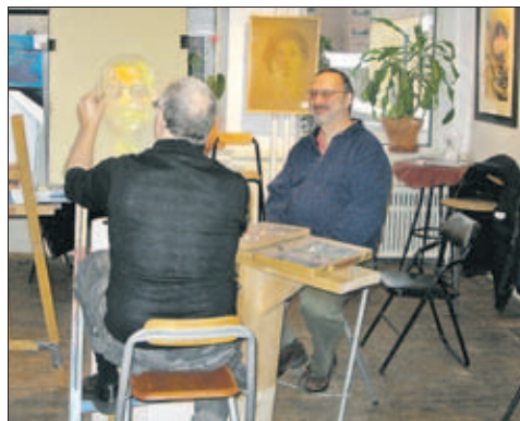
A guest sits patiently while his portrait is drawn