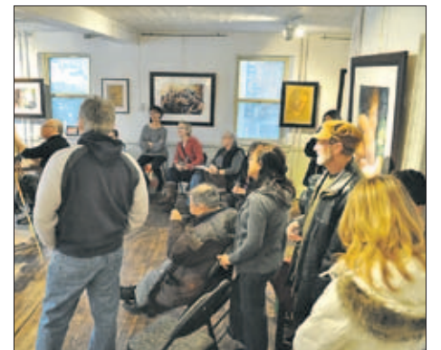
The live demonstration captivates the audience