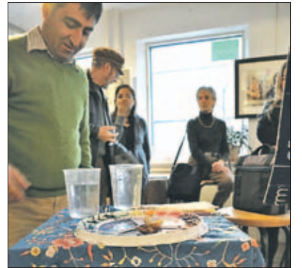
Guests mingle at Luc Sculpture School and Studios