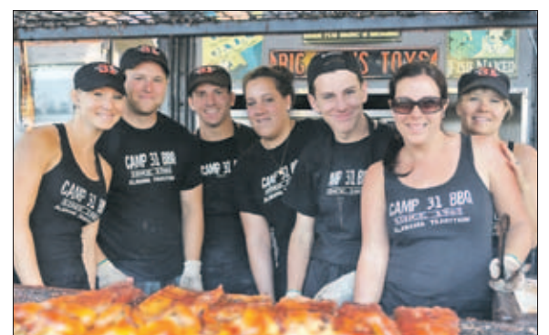
The Camp 31 team takes a 5 second break for a quick photo