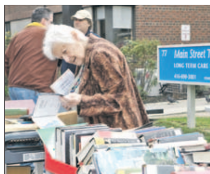
A resident combs through the rows of books