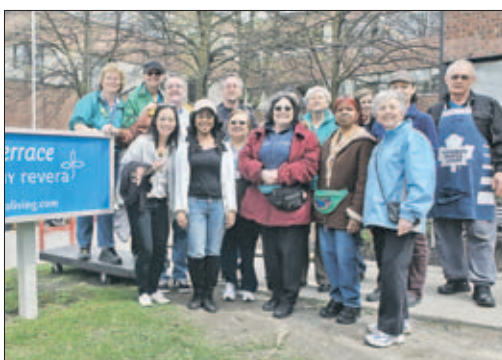
Staff of Main Street Terrace