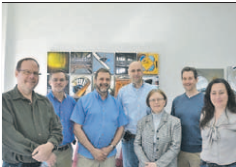
Locals, friends and artists out to experience the exhibit.

Matthew Kellway constituency office at 155 Main St. hosted an art exhibit titled "Beautiful Industrial" Sunday, May 2nd. The exhibit explored several structures of industry located in Toronto's east end including images of the R.C. Harris Water Filtration and Treatment Plant, Ashbridge's Bay Waste Water Treatment Plant and the abandoned R.L. Hearn Generating Station. Photographers presented a sampling of visual aesthetic views they experienced in these man-made structures dedicated to the provision of vital resources required for urban living. The exhibit featured the work of a group of seven photographers; Rosemary Beach, Doug Davidson, David Frame, Margit Koivisto, Fraser Shein, Natalia Shields and Rod Trider who go by the name of Queen East Photography Collective (QEPC).