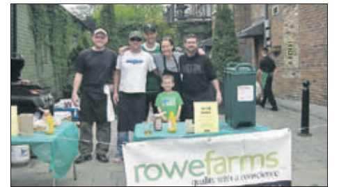
Volunteers from the 4th Anniversary Barbecue

Rowe Farms in Leslieville organized a fundraiser barbecue in May with all the proceeds going to the Red Door Shelter. The charitable event coincided with Rowe Farms' 4th anniversary. The festive afternoon saw staff and volunteers serve up hot dogs and burgers off the grill to residents in the community, on what was a gorgeous, sunny day.