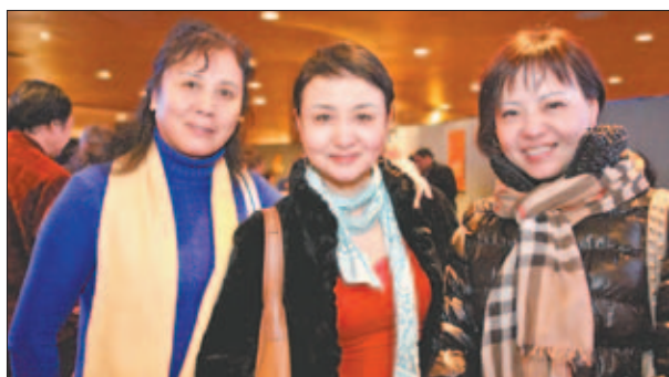
Enjoying the VIP reception at the Sony Centre for Performing Arts

To celebrate the 2012 Chinese New Year, Canada-China Cultural Development Association presented a spectacular performance of the renowned China National Performing Arts Group from Beijing's Chinese New Year (CNY) Carnival China. Prior to the electrifying show, special guests congregated on the second-floor of the Sony Centre for the Performing Arts for a VIP reception. The small gathering featured prominent members involved in the production of the performance, politicians as well as adoring fans. The sold-out concert featured over 80 top-level artists performing spellbound musicals with exquisite costumes. The extraordinary history of Ancient China was depicted through music, dance, acrobatics and visual performances, making this year's dazzling show a must see for the whole family.