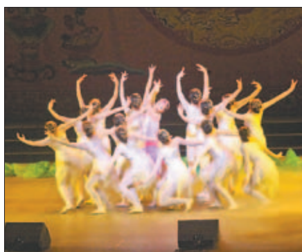
Dancers blossom on stage